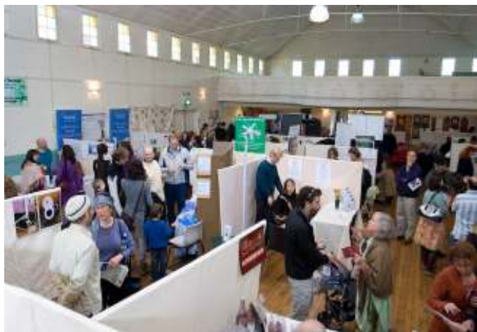
The venue for the first All Natural Expo.

A Café was set up in the Hall and provided organic food on compostable or recyclable plates and a coffee and juice vendor serviced the event.