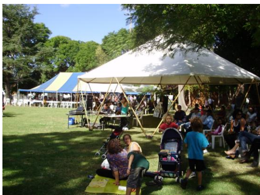
The 2010 Multicultural Festival of the Five Senses took place at Market Square, Grafton on Saturday 22 nd May.

The Multicultural Festival of the Five Senses is funded by the Community Relations Commission for Multicultural NSW and supported by Clarence Valley Council. The festival was a celebration of the region's rich cultural, linguistic and religious diversity and included traditional dance, song, art, food and information. The purpose of the festival was to strengthen the local community, build community networks, encourage community participation and improve understanding of the value of cultural diversity.