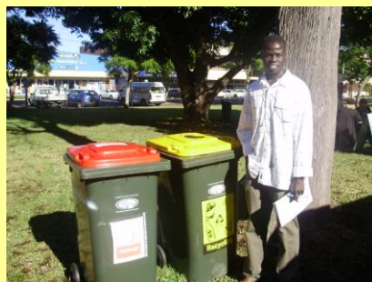
Multicultural Festival of the Five Senses - A Waste Wise Event