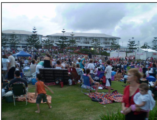
Salt Carols under the Stars in 2007

This was the fourth year of the event and the second year that it has been run as a 'Waste Wise' event. Prior to 2007 all waste generated was sent to landfill but this year the event organiser Salt Events wanted to build on the achievements of 2007 to make the event more 'waste wise'.