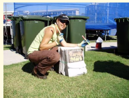
Newspapers & Glow Sticks found in the waste